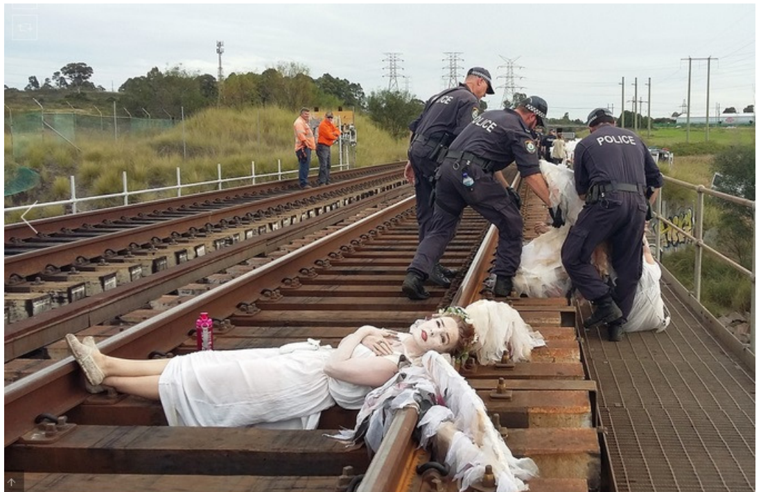
The Climate Angels—Laying it on the line

For more information, visit www.australia.breakfree2016.org .