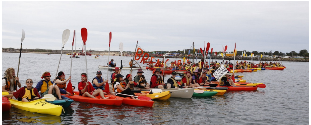
The Newcastle Blockade