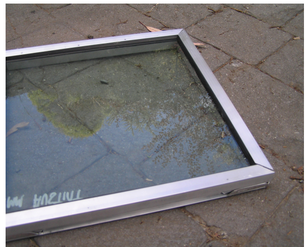
My frame for aluminium windows

So, if you would like to have your aluminium framed windows secondary glazed with me doing all of the work, give me a call. I cannot guarantee that it will work perfectly but I will try very hard to make it work. And if you decide you want it removed within 12 months, I will give you your money back!