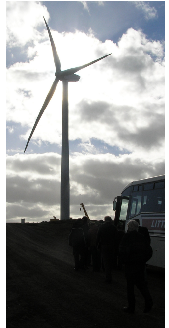
My wind farm